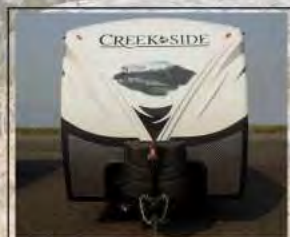
HD Fiberglass Front Cap w/ Armor Guard & LED Lights (23DBS, 23RKS, 26RLS, 27DBHS, 27BHS)