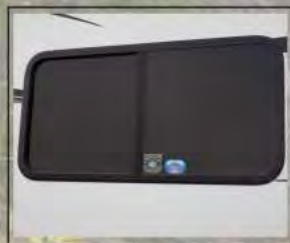
"Mountain Extreme" Thermal Pane Windows