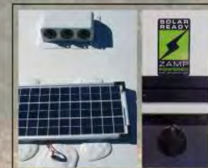
"No Boundaries" Off-Grid Solar Ready - Includes Door Side Portable Solar Port