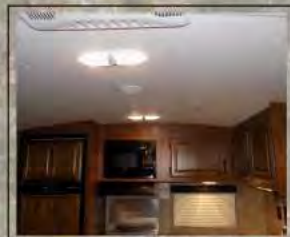
Vaulted Radius Ceiling Providing 5" of Additional Headroom