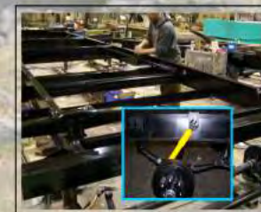
Custom Built Cambered Off-Road Chassis HD Shock Absorbers