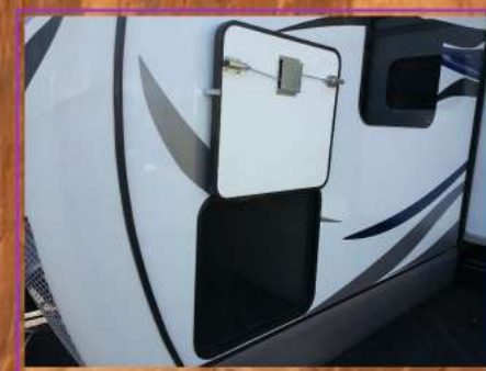
1" Thick Thermal Insulated Luggage Door Compartments