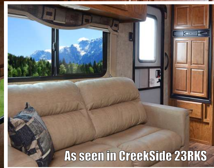
As seen in CreekSide 23RKS