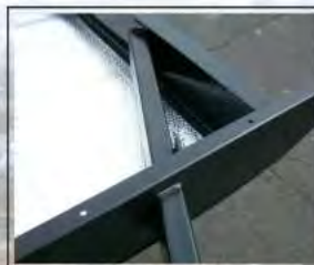
Rugged Integrated A-Frame Chassis Construction