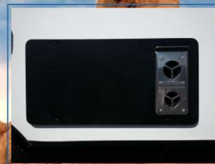
15% Larger XL Furnace (Extreme Camping Heat System)