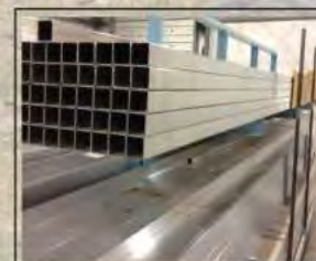
Rugged 2" Bonded Aluminum Frame Walls (Every Exterior Wall)