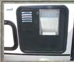
10 Gallon LP/110V Water Heater (NA 20FQ, 21RBS, 23BHS)