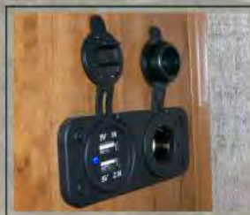
12 volt Triple Charge Station (Charges iPads and Cell Phones)