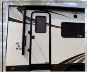
Friction Hinge Entry Doors with XL Grab Handle