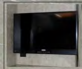
19"-32" 12V Jensen LED Living Room TV (Model Specific)