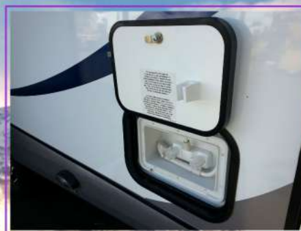
Exterior Shower Insulated by 1" Thick Thermal Insulated Luggage Door