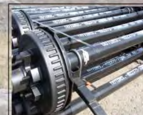
Heavy Duty 6 Lug 5200lb Axles with Off-Road Brake System (23DBS, 23RKS, 26RLS, 27DBHS, 27BHS)