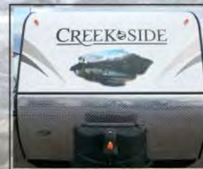
Laminated HD Front Wall w/ Extra Tall Diamond Plate (20FQ, 21RBS, 22RB, 23RBS, 23BHS)