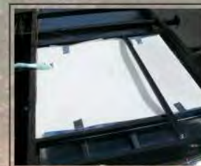
80 Gallon Fresh Water Capacity (Most Models)