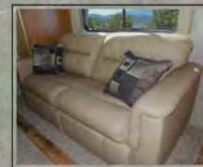
Ultra Leather Tri-Fold Sleeper Sofa (Select Models)