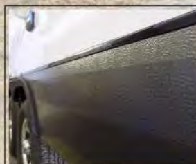
Rugged Charcoal Embossed Sidewall Skirts (23DBS, 23RKS, 26RLS, 27DBHS, 27BHS)