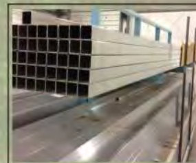
Rugged 2" Bonded Aluminum Frame Walls (Every Exterior Wall)