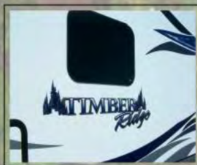
"Mountain Extreme" Thermal Pane Windows