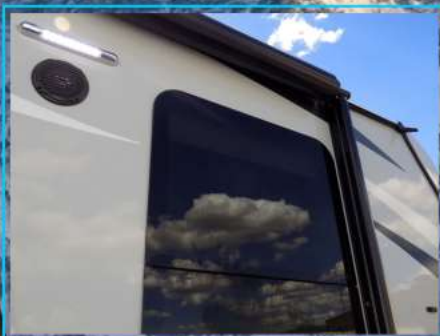
"Mountain Extreme" Thermal Pane Windows