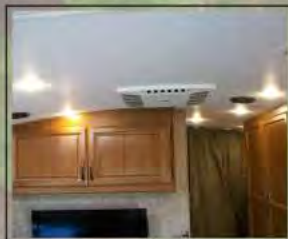
Vaulted Radius Ceiling Providing 5" of Additional Headroom