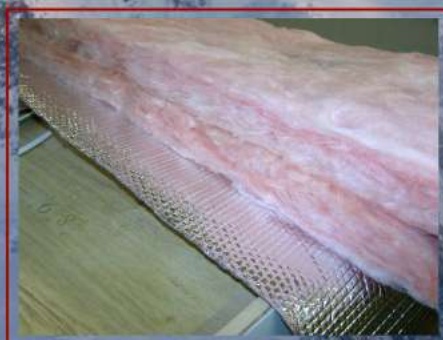
Triple Layered Four Seasons Roof Insulation