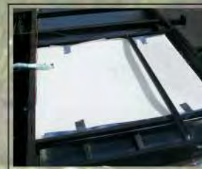
80 Gallon Fresh Water Capacity