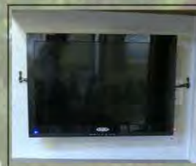
36" 12 Volt LED HD TV With Bluetooth Home Theatre Sound System (28" on 260RLS)