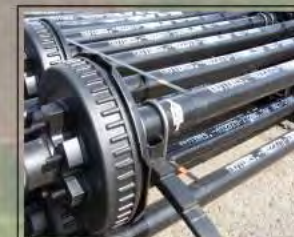
Heavy Duty 6 Lug 5200lb Axles with Off-Road Brake System