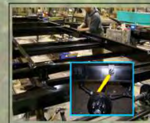
Custom Built Cambered Off-Road Chassis HD Shock Absorbers