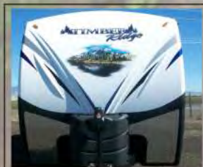
HD Fiberglass Front Cap with Armor Guard, Diamond Plate Protection, & LED Lights