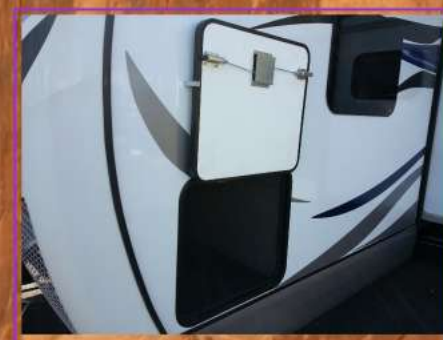
1" Thick Thermal Insulated Luggage Door Compartments