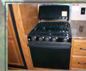
22" Sealed Burner Range & Insulated Glass Front Oven