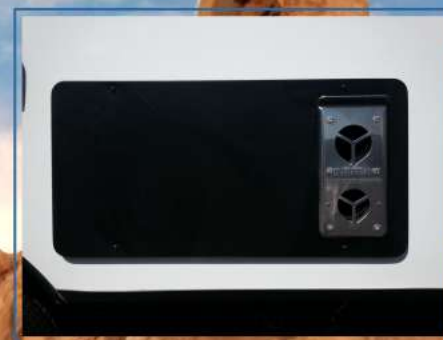
15% Larger XL Furnace (Extreme Camping Heat System)