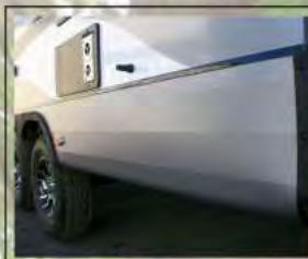
Rugged Silver Embossed Sidewall Skirts