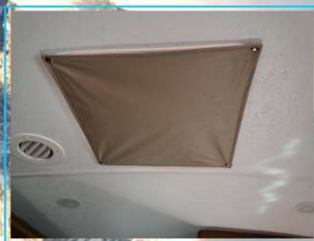
Insulated Snap Cover for Select Roof Vents (Model Specific)