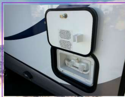
Exterior Shower Insulated by 1" Thick Thermal Insulated Luggage Door