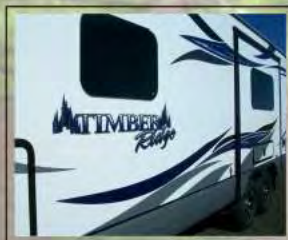
High Gloss Lamlux 4000 Fiberglass