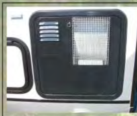
10 Gallon LP/110V Water Heater