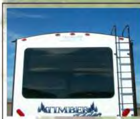
Radius Crowned Full Walk-On Roof w/Ladder