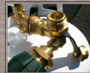
"Outdoors Style" BBQ Hookup Bib & 12" Hose