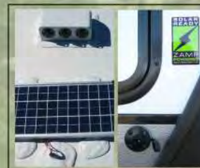
"No Boundaries" Off-Grid Solar Ready - Includes Door Side Portable Solar Port