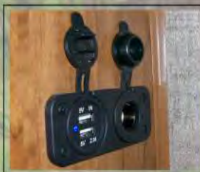
12 volt Triple Charge Station (Charges iPads and Cell Phones)