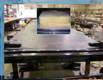
Fully Enclosed Front to Back Heated & Insulated Underbelly / Double Mountain Floor Insulation